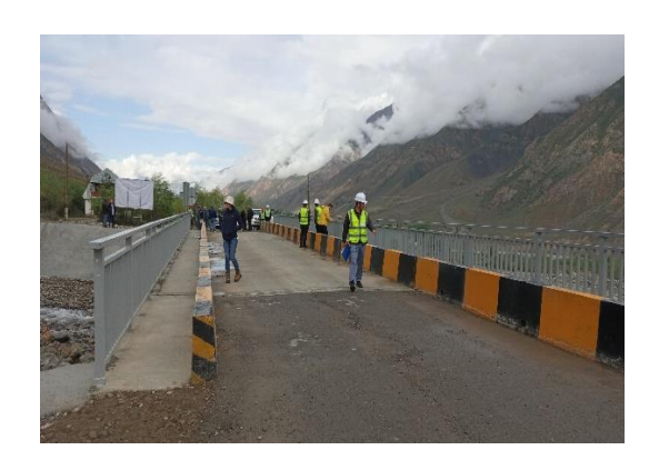
Bridge No. 14 and unique bridge

The construction of bridge No. 15 (Darvaz region) and the innovative solutions adopted during the construction work on this bridge left a special impression. A unique bridge rehabilitation method was applied: gabion nets have been installed and other quality materials have been used by the Contractor.