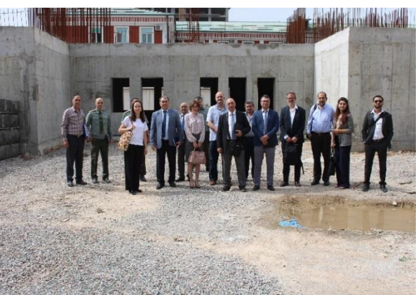
The Mission's visit to the Committee of Emergency Situations and Civil Defense of Tajikistan where the National Center for Crisis Management is being built