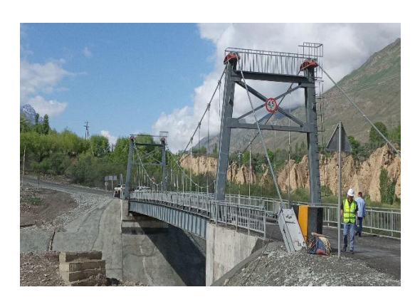
Bridge No. 7, Vanj district