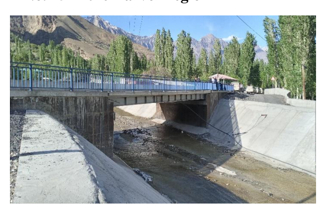
Bridge No. 9, Rushansky district