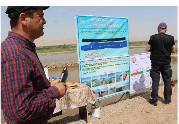
The World Bank team gets acquainted with the restoration works in the Kabadiyan region, the left bank of the Kafirnigan River

Moreover, the Mission has discussed with representatives of the Ministry of Finance, the Ministry of Transport and the Committee of Emergency Situations and Civil Defense the main directions of the future WB project – Tajikistan Preparedness and Resilience to Disasters Project.