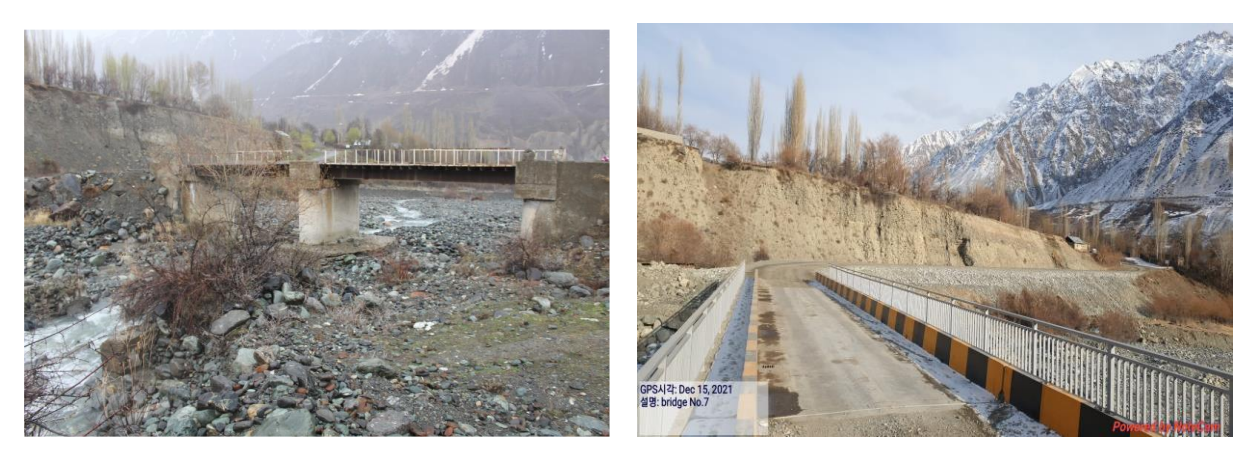
Bridge No. 7 after rehabilitation

Bridge No. 8 is located on the Ardobak River, on the Vanj-Dursher road of the Jovidon jamoat, Vanj region. The length of the new bridge is 25.1 meters. In addition, builders restored 258 meters of the road to the right and left of the bridge. The bridge is open for use.