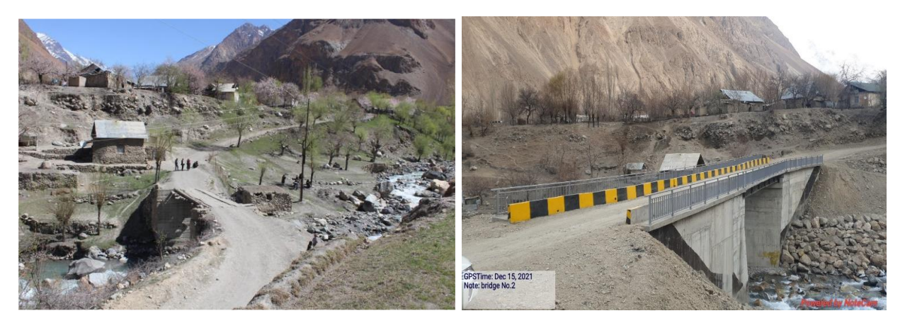
Bridge No. 2 before and after rehabilitation

Bridge No.2 is located between the villages of Andarbak and Langar, Jamoat Yazgulom, Vanj district. The length of the new bridge is 19.17 meters. The bridge is open for use.