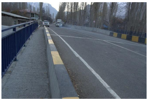
Bridge No. 9 after rehabilitation