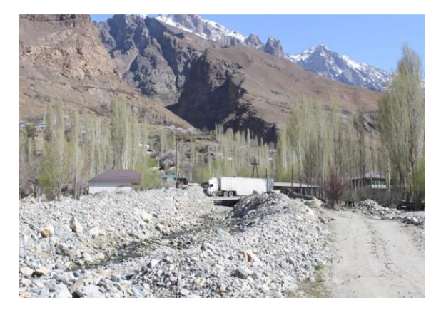
Bridge No. 9 before rehabilitation

Bridge No. 9 on the Dushanbe-Khorog highway, located in the village of Barrushon, Rushan district. The length of the new bridge is 19.1 meters. In addition, builders restored 414 meters of the road to the right and left of the bridge. Bridge open for use.